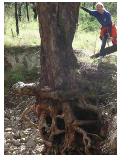
1 A Grottesque or The Screams?